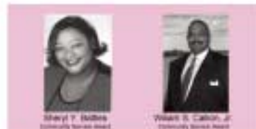
Cheryl T. Embles Community Service Award